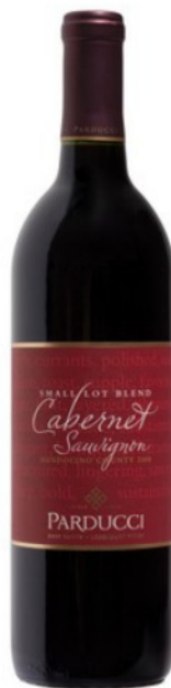
Parducci Small Lot Blend Cabernet Sauvignon

Read the words streaming across the tall red label for good descriptors: Yummy, currants, structured, elegant. The Parducci Small Lot Blend Cabernet Sauvignon Mendocino County 2009, $11 , is an exceptional Cab for the price — the flavors are soft and approachable — black currants, cherries, plums, brown spices and dark chocolate. It has wonderful dusty tannins that cling to the palate. Balance is spot on. Eleven bucks? It overperforms for the price. What gives? The Thornhill family purchased this legendary winery in 2004 and set out on a program to revitalize the estate. The family is committed to sustainable agriculture, and the winery is carbon neutral meaning it only uses solar and wind-powered energy. The Small Lot Blend line is produced by blending many different small batches of wine. The wines are aimed at restaurants but you can find them in wine shops.